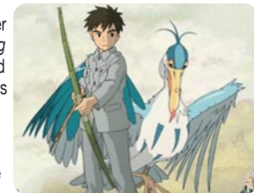
Both Japanese language (with subtitles) and English language versions

A semi-autobiographical fantasy from the mind of Hayao Miyazaki, legendary anime director and founder of Studio Ghibli - Spirited Away , Totoro , Howl's Moving Castle among many of his classic films. His latest, and likely the final film from this 82-year-old genius, follows young boy named Mahito, yearning for his mother, ventures into a world shared by the living and the dead. There, death comes to an end, and life finds a new beginning. We are showing the original Japanese language version (with Eng. subtitles) at Eastend and the English cast version - featuring Christian Bale, Gemma Chan, Robert Pattinson - at Prospect.