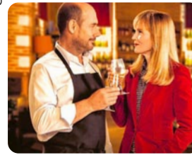
French language with English subtitles

Hortense (Isabelle Carré) has a big heart and no one to share it with except her cat, her embittered mom, and a group of homeless people for whom she prepares a gourmet dinner at the local church every week. While buying a nice bottle of wine, Hortense meets Jacques (Bernard Campan), a fifty-something, grumpy local cellarman. Eager to see him again, she attends a chaotic wine tasting in Jacques' shop - meeting his best friend who clumsily tries to seduce her. As Hortense and Jacques grow closer and closer, their past begins to catch up to them.