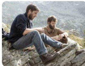
Italian language with English subtitles